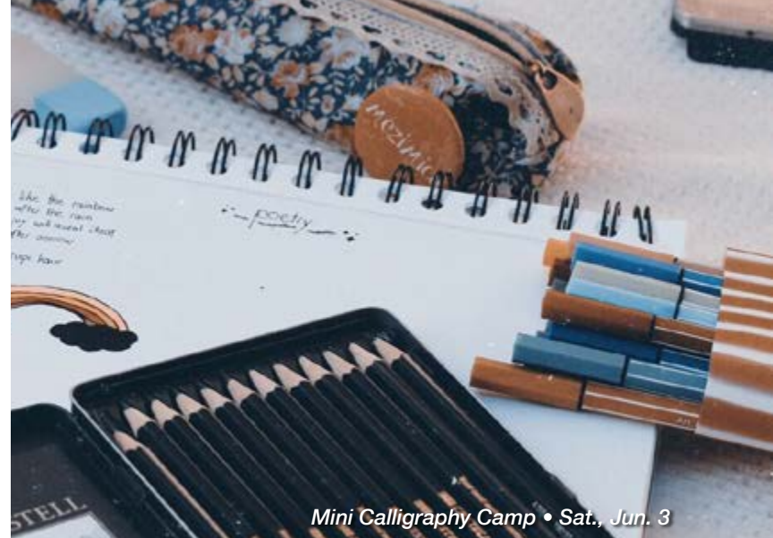
Mini Calligraphy Camp • Sat., Jun. 3