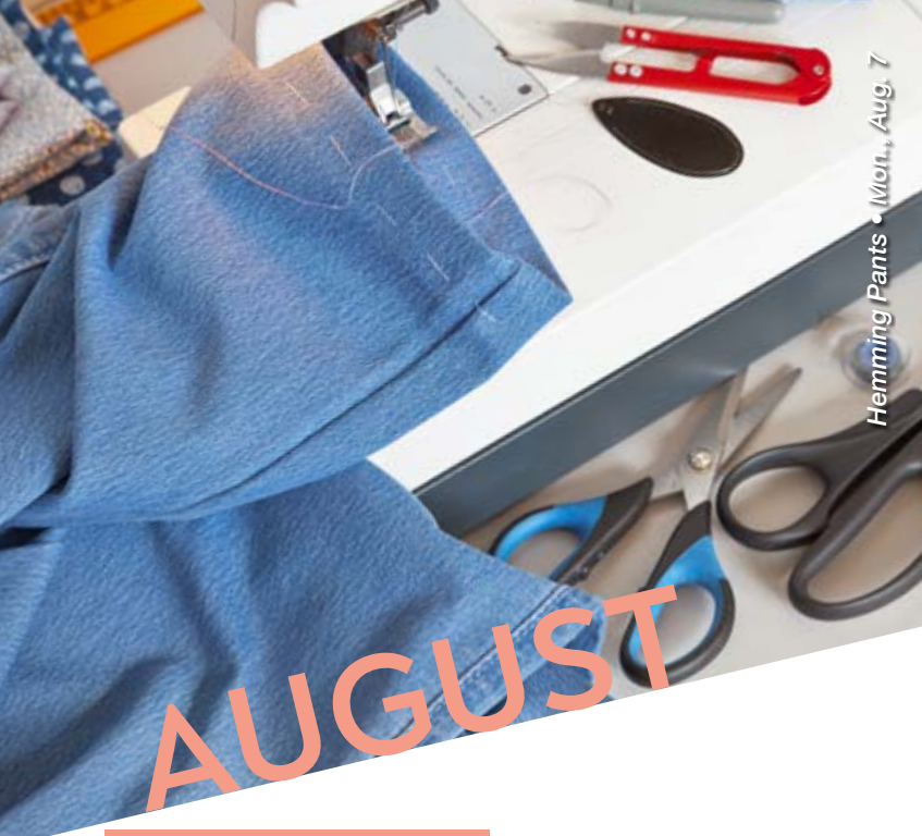
Hemming Pants • Mon, Aug. 7