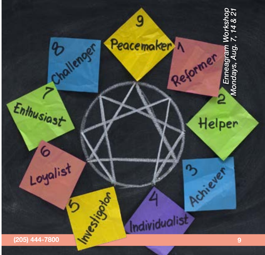
Enneagram Workshop Mondays, Aug. 7, 14 & 21

CLOSED • Staff Training Day * Registration required