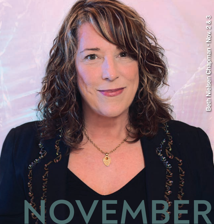
Beth Nielsen Chapman • Nov. 2 & 3